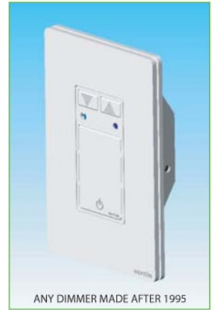
ANY DIMMER MADE AFTER 1995