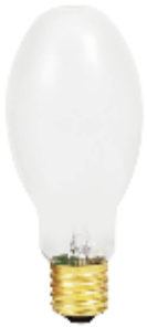
Mercury Vapor BD17 CO