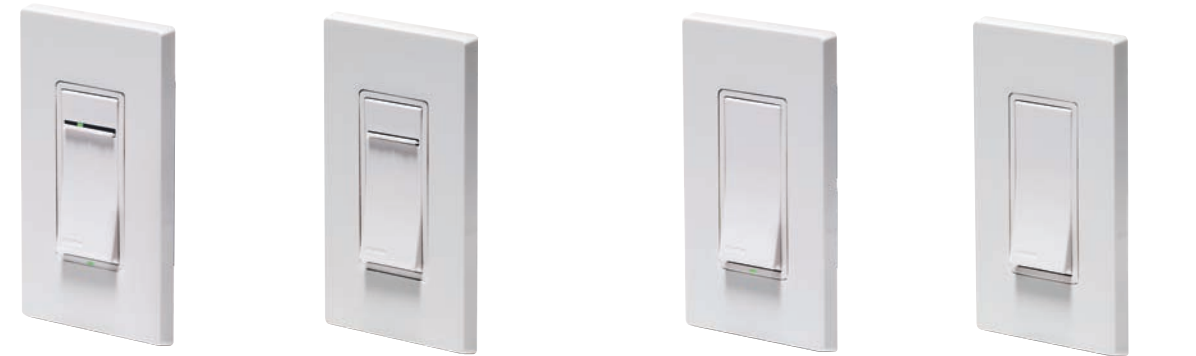
Dimmer Fan Speed Control Matching Dimmer/Fan Speed Control Remote