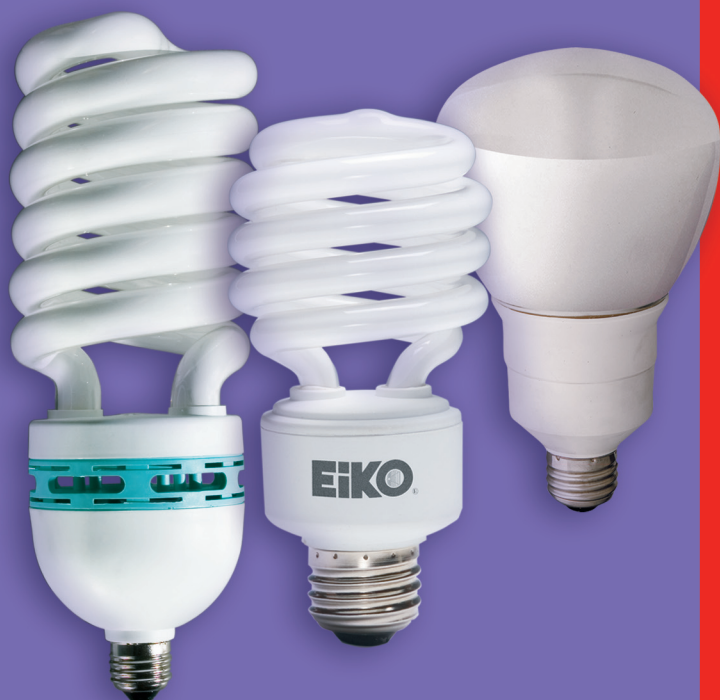
DUOTUBE® QUADTUBE® TRIPLETUBE FML