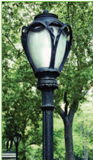
Acorn cover not included. Existing acorn fixtures will still function with LED lighting.