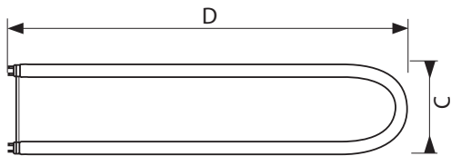
FB32T8/6 25W ADV835 XEW ALTO