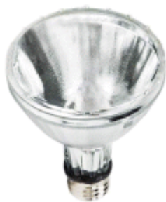
CDM PAR30L SP