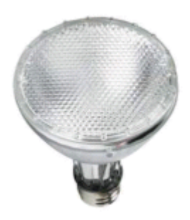
CDM PAR30L FL