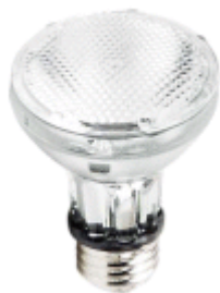
CDM PAR20 FL