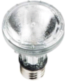
CDM PAR20 SP