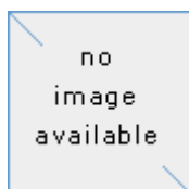
CDM ED17 CL