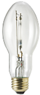
Ceramalx BF55 CL