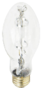
CDM ED17P CL