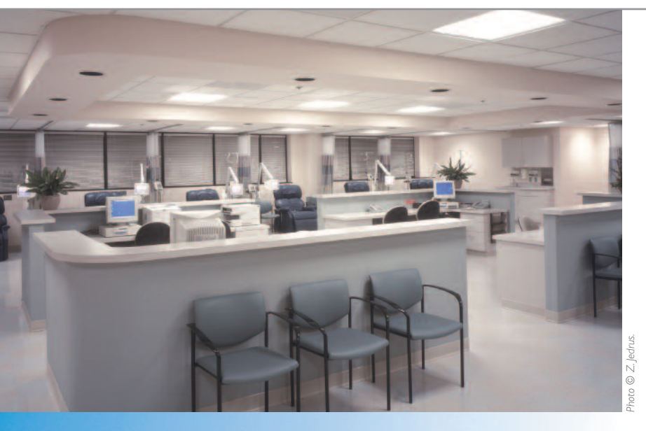
Ideal for commercial applications with 2' x 2' fixtures