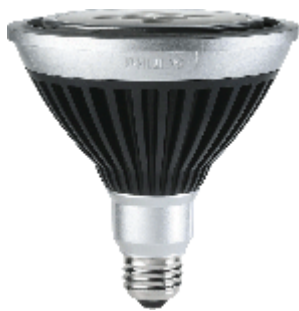
EnduraLED E26 PAR38