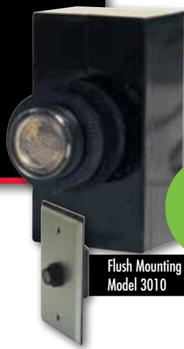
Flush Mounting Model 3010