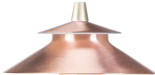
R-G264C-UFC Unfinished Copper (UFC)