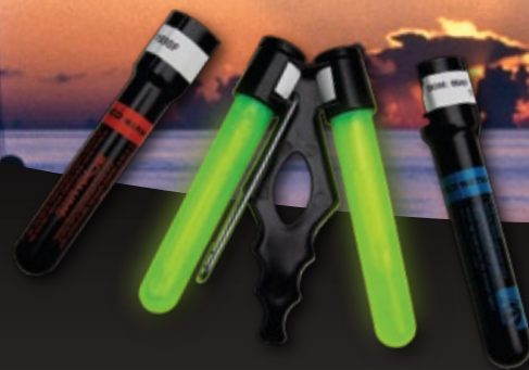
DUAL PERSONNEL MARKER LIGHT (PML)