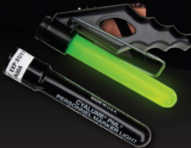
PERSONNEL MARKER LIGHT (PML)

USCG approval #161.112/63/0 #161.012/63/0