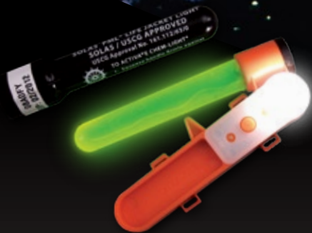
SOLAS PERSONNEL MARKER LIGHT (PML)

USCG approval #161.112/63/0 #161.012/63/0