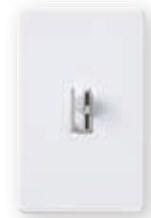
Ariadni®/C•L Gloss colors Coming Soon