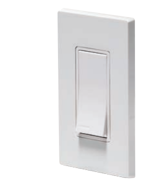
Coordinating Switch Remote