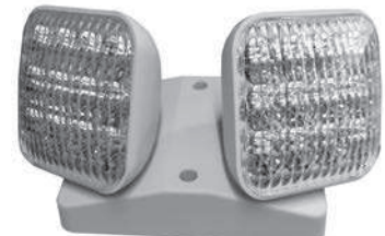
Double Lamp with No Options