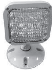
Single Lamp with Weatherproof (WP) Option