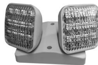
Double Lamp with No Options