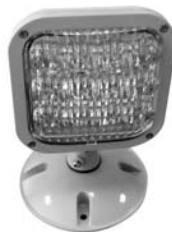
Single Lamp with Weatherproof (WP) Option