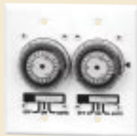
Dual Timer (2-gang with 2 KM2's)