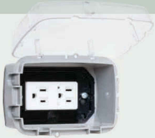
GFCI DEVICE SHOWN NOT INCLUDED