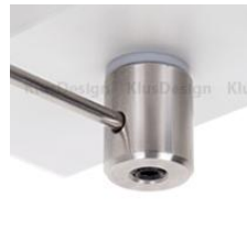
transverse fastener for BOX, conductive (42554)