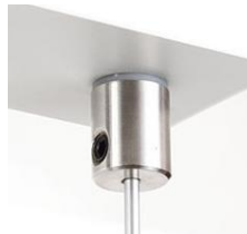
longitudinal fastener for BOX, conductive (00643)