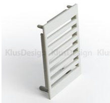
end cap BOX (00314)