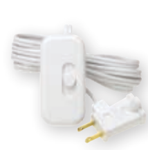
Credenza®/C•L Black (BL), White (WH), and Brown (BR)