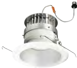
Retrofit unit as shown NLEDR-66130HZW