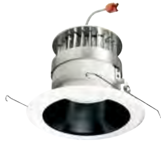
Dedicated unit as shown NLEDC-66130BW