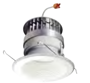
Dedicated unit as shown NLEDC-56230WW