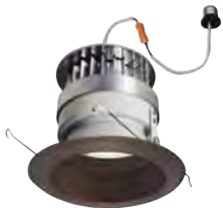
Retrofit unit as shown NLEDR-56230BZBZ