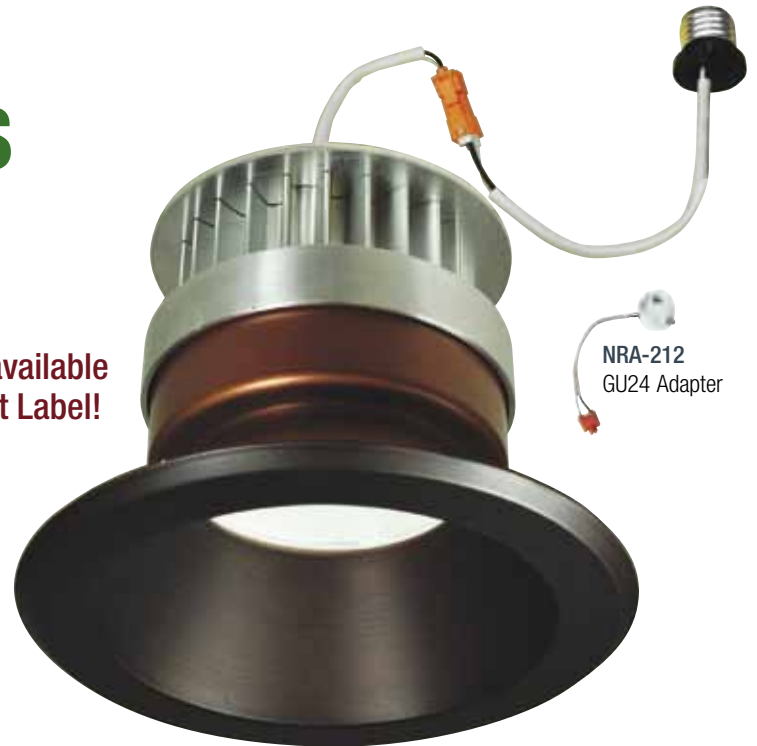
NRA-212 GU24 Adapter