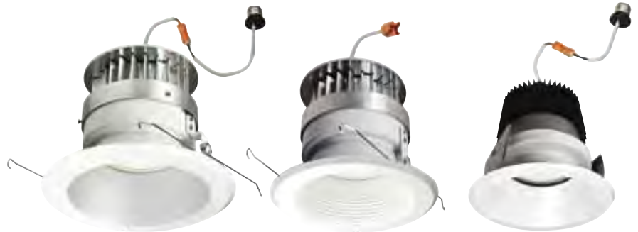
6" unit as shown NLEDR-66140HZW NLEDR-67140HZW