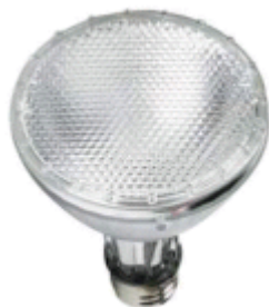
CDM PAR30L FL