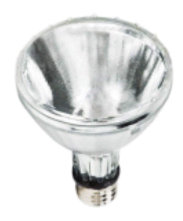
CDM PAR30L SP