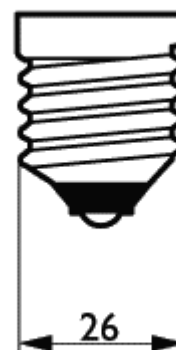
Cap- Base E26