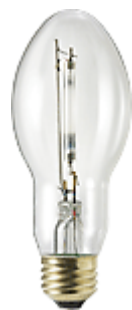
Ceramalx BD17 CL