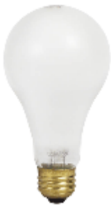
Mercury Vapor A23 CO