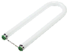
F-T12-UR Med Bipin/GB