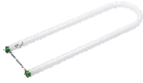
F-T8-URS Med Bipin/GB