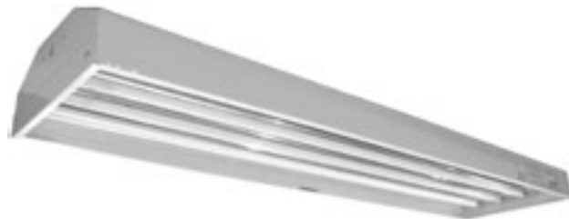
LAMPS NOT INCLUDED

Any housing component that fails due to manufacturer's defect is guaranteed for two years from time of shipment. Ballasts are warranted for five years from time of shipment. Warranty does not apply to damages caused by improper installation, abuse, fire or acts of God. Lamp is not covered by manufacturer's warranty.