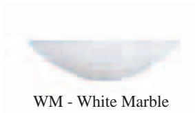
WM - White Marble