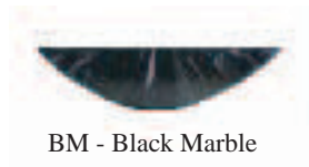
BM - Black Marble