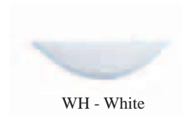
WH - White