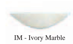
IM - Ivory Marble