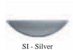
SI - Silver