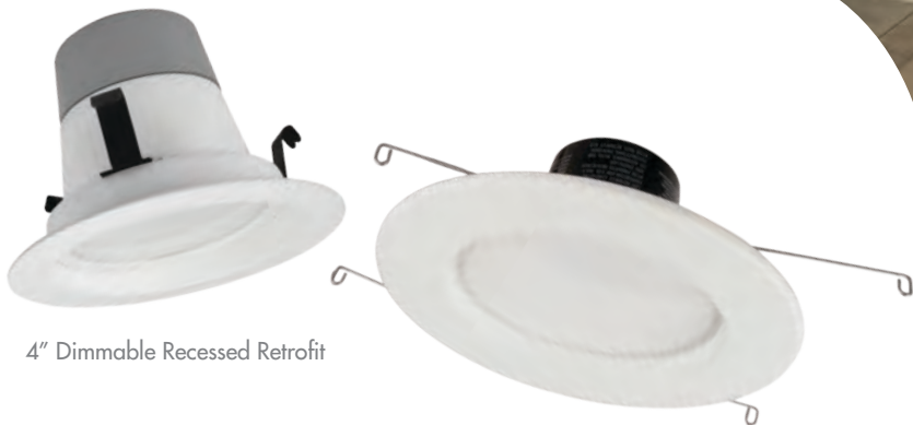
4" Dimmable Recessed Retrofit