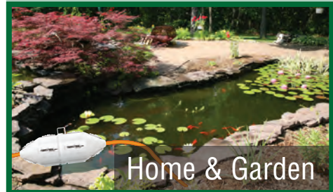
Home & Garden