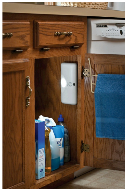
Model # - BL200